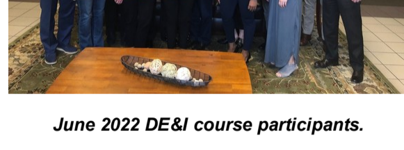
June 2022 DE&I course participants.